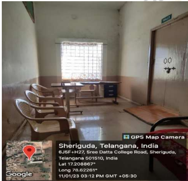
Girls waiting room inside

College has separate common rooms for girls with required facilities like sitting arrangement, attached washroom etc. The common rooms contain facilities like chairs, tables and beds etc. The SDI established a Day care centre. The main aim of establishing a day care centre in the college is to look after the children of the faculty