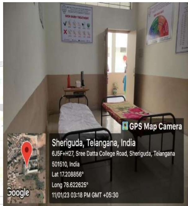
Sick room facility