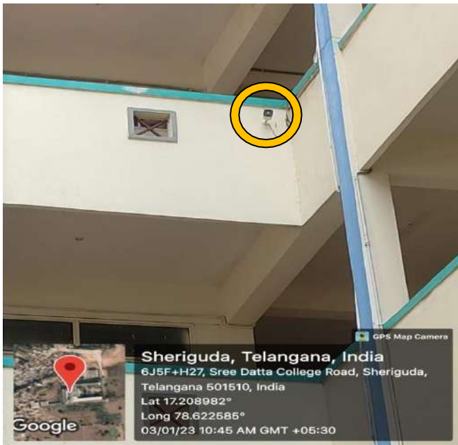
CCTV in the corridor