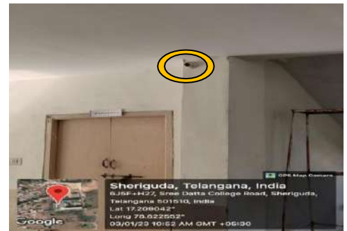
CCTV in the corridor