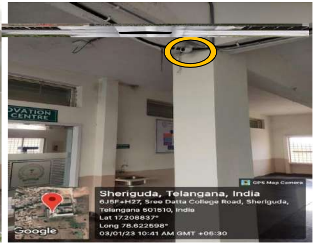
CC Cameras installed at various locations in the campus