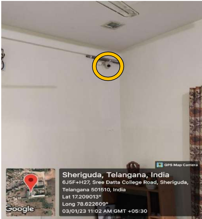
CCTV in the principal room

Nagarjuna Sagar Road, Sheriguda (V), Ibrahimpatnam (M), R.R.Dist., Greater Hyderabad-501510. T.S