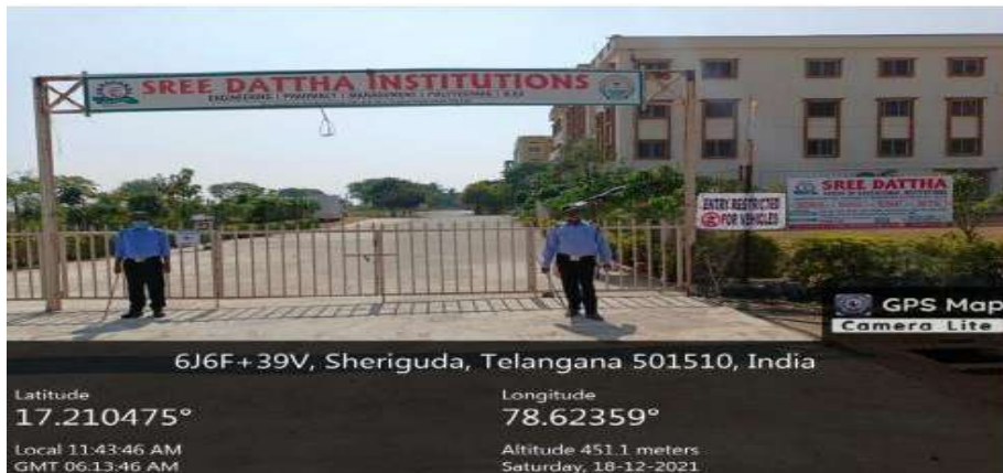
Security at main gate SDI

Security personnel work round the clock (24x7). to keep check on trespassers. The College is equipped with CCTV which provides 24 hrs of surveillance in order to monitor all ongoing activities. The campus is equipped with a complaint box which is situated near the entrance gate intended to gather any suggestions or address any complaints regarding any abuse. The Institute has committees to monitor and address safety and social issues viz., Anti Ragging Committee, Discipline Committee and Grievance Redressal Committee. Entry is allowed inside the campus against valid identity cards