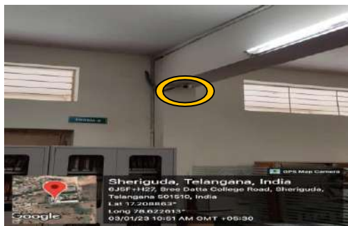
CCTV in the library