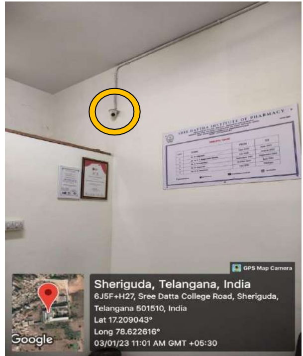
CCTV in VP room