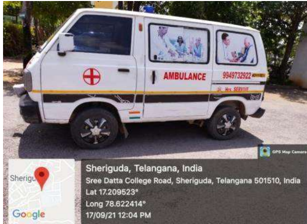
Ambulance in the college premises

( Approved by AICTE & PCI, New Delhi, Affiliated to JNTUH, Hyderabad, T.S) Nagarjuna Sagar Road, Sheriguda (V), Ibrahimpatnam (M), R.R.Dist, Greater Hyderabad-501510. T.S Ph.:+91-8801099936/35, 9393808082, Email: principalsdip@sreedattha.ac.in, www.sreedattha.ac.in