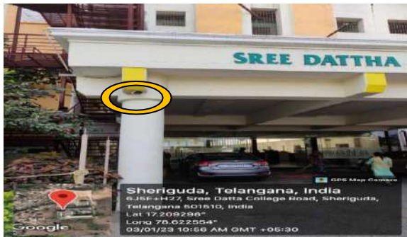
CCTV at the entrance