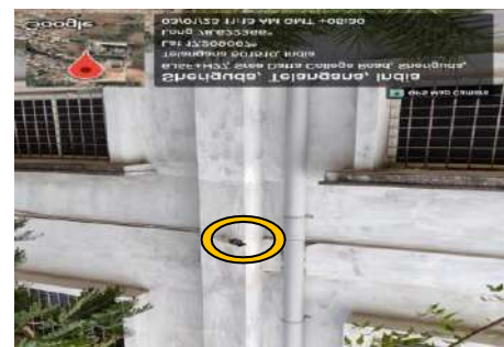
CCTV in the backside