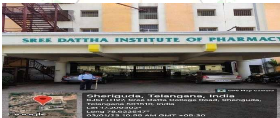
Security at Entrance SDIP