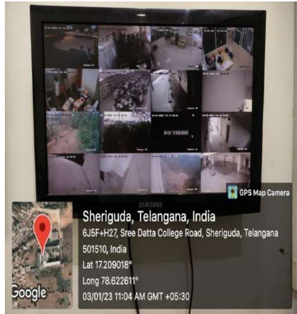
CCTV monitoring from Principal room