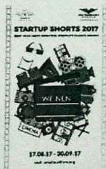
WF NEN Startup Shorts 2017.jpg 1289K